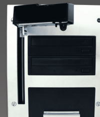
The Cube 2™