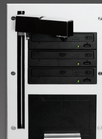
The Cube 3™