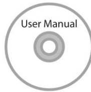
Standard Operation User Manual Booklet or CD