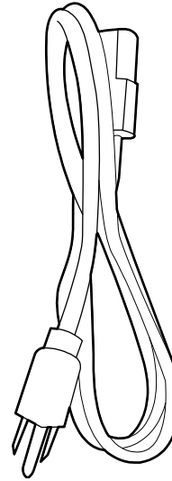
Power Cord Cable